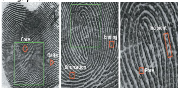
Fig: 3. Feature Extraction Showing Feature Levels In A Fingerprint.

AFIS technology exploits some of these fingerprint features. Fraction ridges do not always flow continuously throughout a pattern and often result in specific characteristics such as ending ridges, dividing ridges and dots, or other information. An AFIS is designed to interpret the flow of the overall ridges to assign a fingerprint classification and then extract the minutiae detail-a subset of the total amount of information available yet enough information to effectively search a search a large repository of fingerprints.